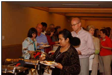
Going through the buffet line