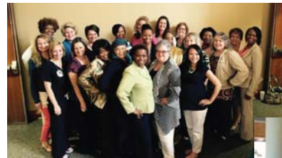
WOC Nurses from around the state gather at Layers of Wound Care Conference in April.

The Birmingham Area Group held a conference April 17, 2015 at the Bruno's Conference Center in Birmingham. Layers of Care by Your WOC Nurses featured our own WOC Nurses discussing topics such as Bariatric Skin Care, Layers of Linen and Driving Down Pressure Ulcer Rates, Lower Extremity Ulcers with Compression Wrap Skills Workshop, Continence/Bowel & Bladder Issues and the Wound Treatment Associate Program. We appreciate all the vendors who supported the Conference. The informative conference was thoroughly enjoyed by all who attended.