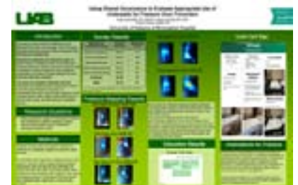
2013 1st Place Poster