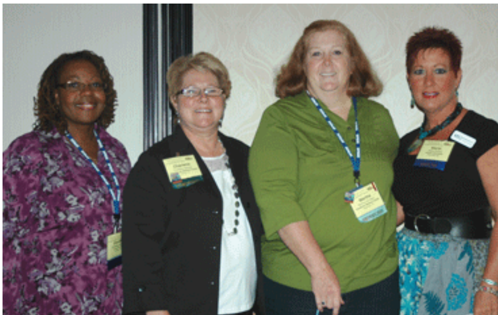
Outgoing Board Members