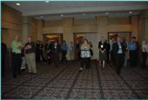
Exhibitors come out to welcome attendees