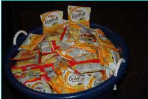
Molnlycke Booth - Goldfish "Going with the Flow"