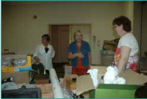
Tennessee nurses busy setting up